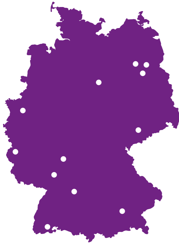
12 locations in Germany

All rights reserved. This document may not be reprinted or electronically reproduced without our prior written permission. Content subject to technical change without notice. Errors and omissions excepted. The publisher shall assume no liability, irrespective of the legal grounds for this. This document supersedes all previous documentation.