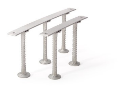
Figure 1: Punching shear reinforcement JDA in ribbed design

JORDAHL® punching shear reinforcements are designed in accordance with: